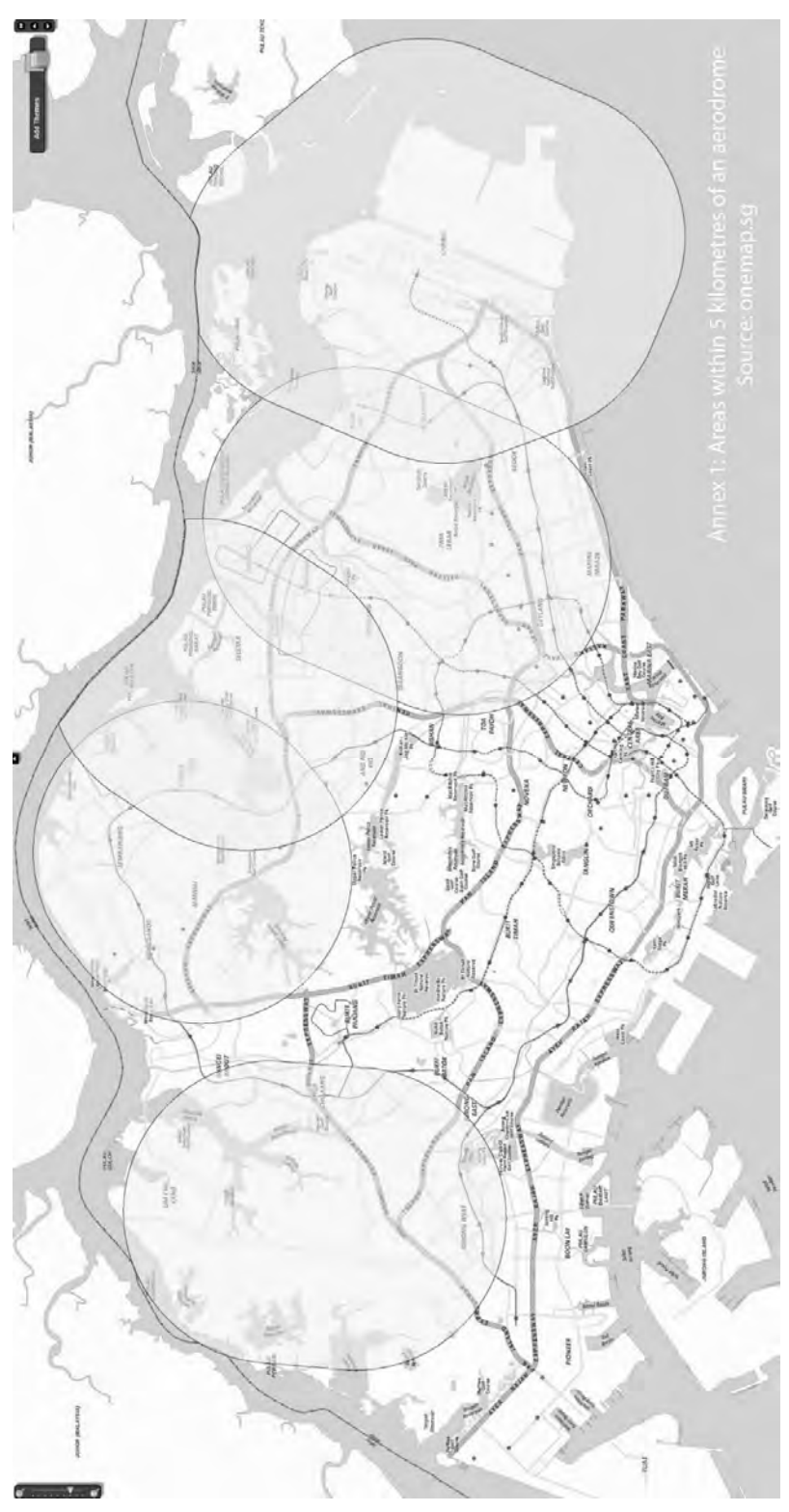
© 2017 Contributor(s) and Singapore Academy of Law. No part of this document may be reproduced without permission from the copyright holders.